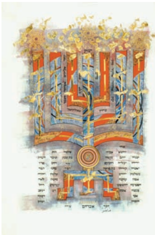
Life of Paul