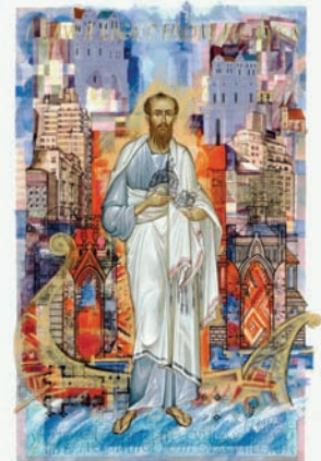
Genealogy of Jesus

"The Saint John's Bible incorporates many of the characteristics of its medieval predecessors: it was written on vellum using quills, natural handmade inks, hand ground pigments and gild such as gold leaf, silver leaf and platinum. Yet, it employs the modern, English translation the New Revised Standard Version (NRSV) as well as contemporary scripts and illuminations."